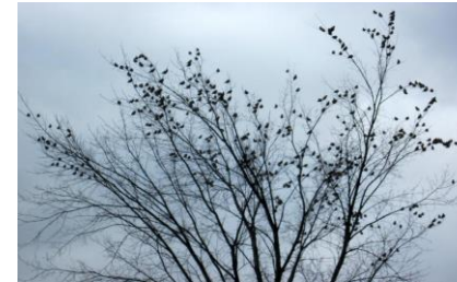
Part of waxwing flock estimated at 240 birds, beside bridge where Trans-Canada Trail crosses over Trout Creek east of the Tanner Line, some 2 km west of Campbellford, 02 January 2011.

http://www.allaboutbirds.org/guide/Cedar_Waxwing/id